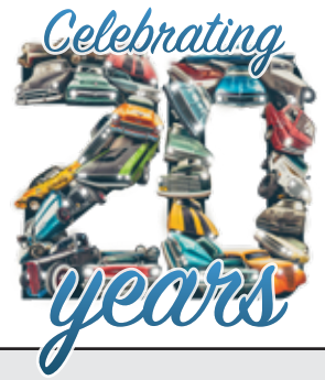
Exhibit Space Rental Agreement

NEW YORK STATE FAIRGROUNDS, SYRACUSE, NY STREET RODS, CLASSICS, CUSTOMS & TRUCKS THRU 1985